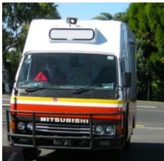
Here comes Mr Whippy!

The special reward that our HERO's received was a visit and icecream from Mr Whippy. Here are some photos.